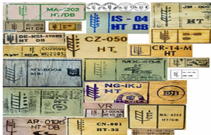
Sample of International IPPC Stamps

Argentina, Bolivia, Chile, Colombia, Costa Rica, Ecuador, Egypt, Guatemala, India, Jordan, Kenya, Lebanon, New Zealand, Nigeria, Peru, Philippines, South Africa, Trinidad and Tobago, Turkey, Vietnam, Venezuela